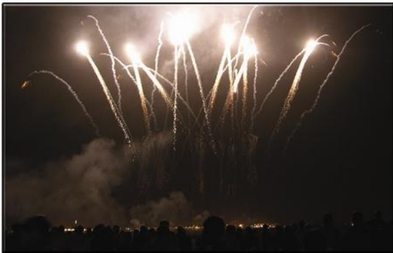
Pictured: Fireworks Show @ APA convention in San Francisco, CA