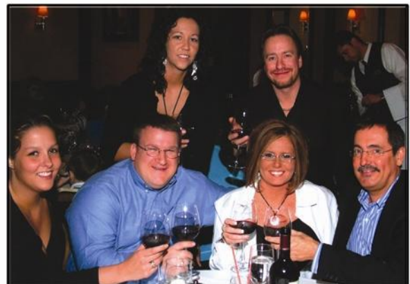
Pictured: NCI Employees & guests at '06 APA Convention in Las Vegas.