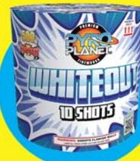
#1656 Whiteout 10 Shot 2-1 500 Gram Cake