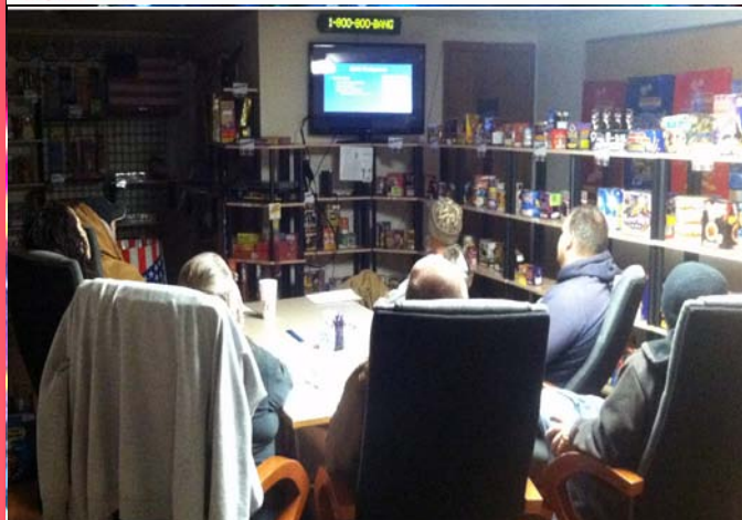
NCI'S WAREHOUSE TEAM WATCHES THE OSHA PRESENTATION

Source: American Pyrotechnics Association As of June 1, 2013