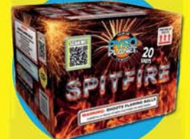
#1655 Spitfire! 20 Shot 6-1 500 Gram Cake