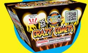
#1654 Crazy Comet 25 Shot 8-1 Finale Repeater