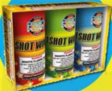
#1653 One Shot Wonder 10-3 Aerial Repeaters