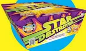
#1657 Star Destroyer 182 Shot 1-1 500 Gram Cake