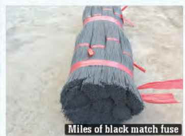
Miles of black match fuse