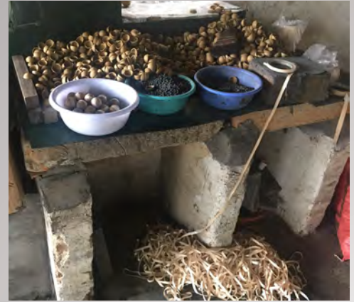
This work station has all of the necessary components to pack chemical components of an artillery shell.