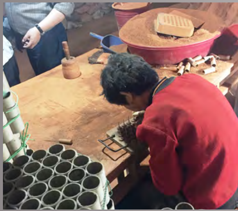
A prep technician places timing fuses and bottom plugs in paper tubes.

fountains, roman candles, novelties, & sparklers to component production which consisted of paper tubes, fuse, shell casings, compound plugs & special effect inserts. Beyond that we visited a fiberglass tube factory, a printing factory, and the logistics consolidation warehouse which gave me a new perspective of how it all comes together. I've had over 10 years of experience in this industry now and always prided myself on a great understanding of how our products came into being. While a lot of what I witnessed wasn't necessarily a surprise, it was a "connecting the dots" experience for sure.