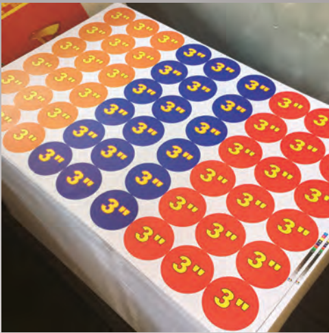
A freshly printed sheet of 3" tube covers.

it is our priority and responsibility to do everything in our power to deliver on that promise. Our relationships remain strong and our reputation as a partner in China is excellent.