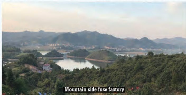
Mountain side fuse factory