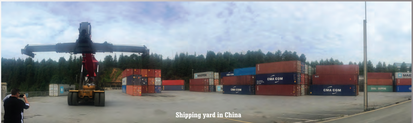
Shipping yard in China

If you loved the documentary Passfire, you may want to check out Passfire the Series: Season 1. It is available to purchase on Amazon or to stream on Vimeo.