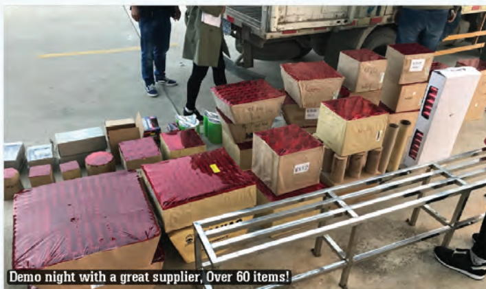
Demo night with a great supplier, Over 60 items!