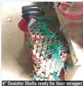
4" Canister Shells ready for their wrapper