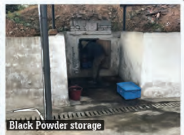
Black Powder storage