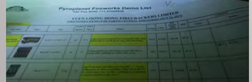
My point of view from one of our China product demonstrations. Sometimes we viewed over 100 items per night.