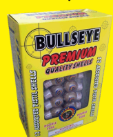
#969 BULLSEYE SHELLS GG (6-12)