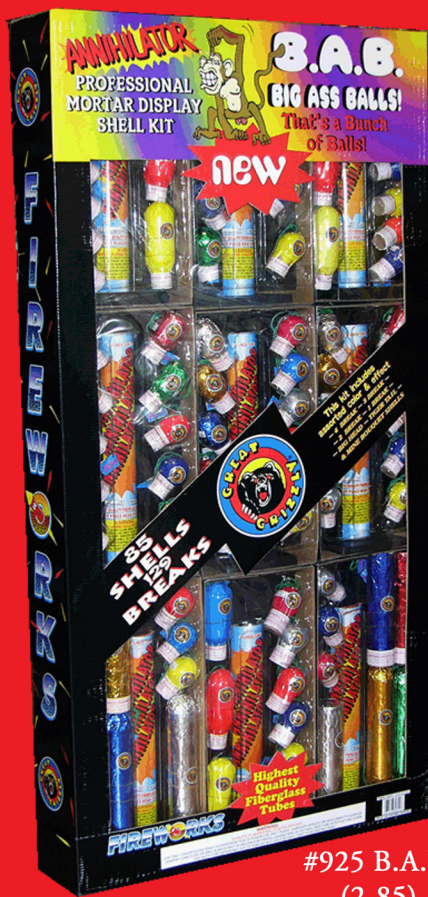
#925 B.A.B. (2-85)

Fireworks items come and go as we are in an industry where “Out with the old, in with the new” usually takes precedence over everything else. There are a few items that defy that logic, however. It may sound cliché, but the Great Grizzly Annihilator Shell Kit (Item No. 925), aka B.A.B. offered by NCI has stood the test of time and is still the most popular selling variety shell kit in retail stores across the country! Did you know that NCI has multiple customers that order this item alone by the container load every year? Now that is a lot of shells, almost 50,000 in fact!