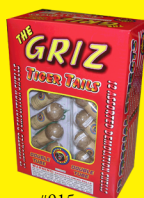
#915 THE GRIZ WITH TIGER TAILS GG (12-12)