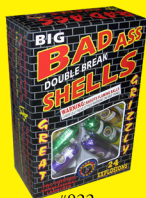
#922 BIG BAD ASS DOUBLE BREAK SHELLS GG (6-12)

Wait, there's more! The good news for you is that in addition to the showcase kit that we provide in the Annihilator, we also provide smaller specialty kits that also are extremely popular! They have also stood the test of time, and NCI proudly still offers the following kits in which you can focus on one of your favorite styles offered in the Annihilator kit and get 12 assorted effects for each style.