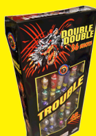
#923 DOUBLE TROUBLE GG (2-36)