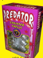
#914 PREDATOR CANISTER SHELLS GG (12-12)