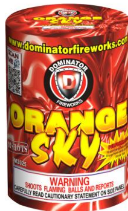
#1681 Orange Sky 10 Shot 30-1 Dominator