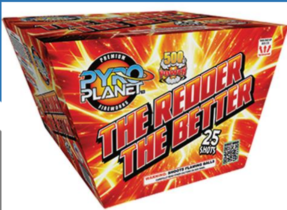
#1807 The Redder The Better 25 Shot 4-1 Pyro Planet

What's your favorite color? No matter what it is we've got you covered with our line up in every shade of the rainbow!