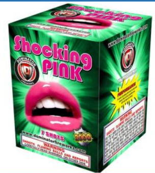
#1692 Shocking Pink 7 Shot 24-1 Dominator