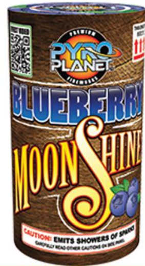
#1792 Blueberry Moonshine Ftn 18-1 Pyro Planet