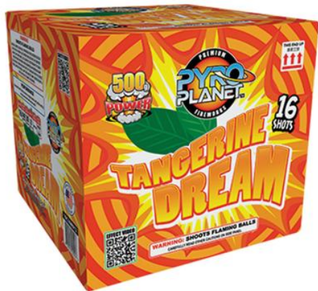
#1808 Tangerine Dream 16 Shot 4-1 Pyro Planet