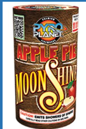
#1791 Apple Pie Moonshine Ftn 18-1 Pyro Planet