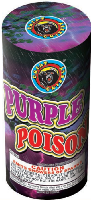
#1071 Purple Poison Ftn 36-4 Great Grizzly