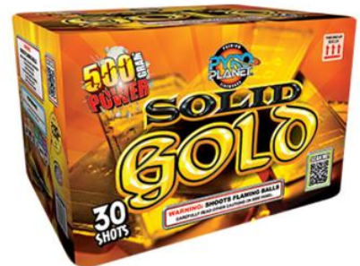
#1796 Solid Gold 30 Shot 4-1 Pyro Planet