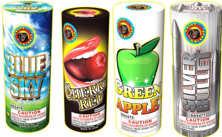
#1670 Premium Fountain Assortment 9-4 Great Grizzly