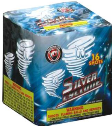
#1684 Silver Cyclone 16 Shot 24-1 Dominator