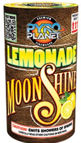
#1793 Lemonade Moonshine Ftn 18-1 Pyro Planet